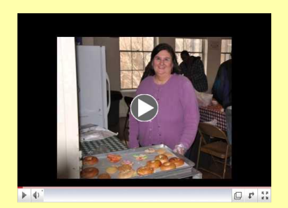
Little Rock Stewpot

To See a short video about the Stewpot, click on the photo below.